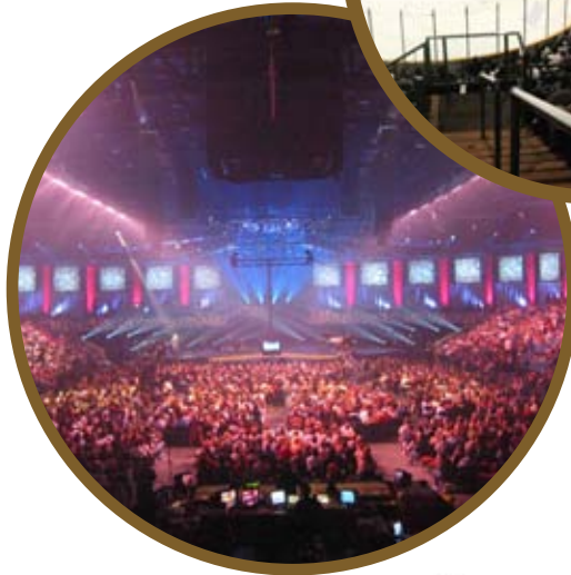
Hockey Capacity: 6,139