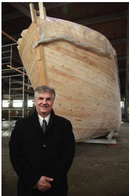
Posing in front of the hull of the Marco Polo replica—“the fastest ship in the world,” built in Saint John.

For 25 years Ogden’s also been volunteering with the city’s South End food bank, involving approximately 2,000 students in the process. “It is more than just raising funds—yes, we do that—or bringing in food, which