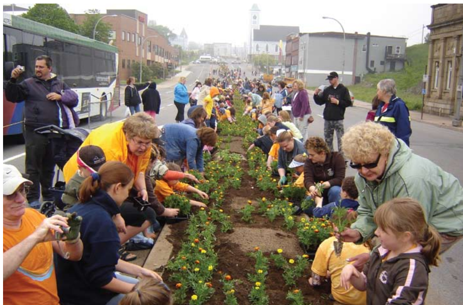
More than two-million marigolds have been grown and planted by thousands of children from Greater Saint John in the past 12 years. "The marigolds make people feel good about themselves."